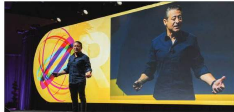
Keynote Explores the Future, Abundance and Data-Driven Optimism

The Oregon Chapter of RIMS represented at Risk World 2024 San Diego this year. A great time was had by all with highly educational sessions, productive networking and incredible activities. Join your Oregon Chapter colleagues in Spring of 2025 when Risk World hits Chicago!